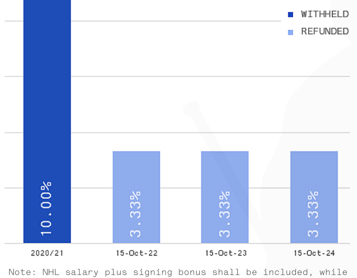
all performance bonuses are excluded.